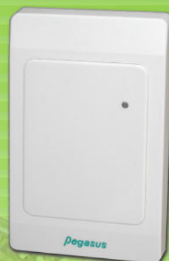
PUA-370 / PUA-380