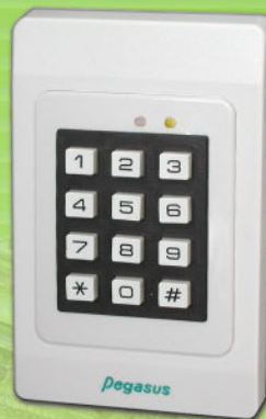
PUA-377 / PUA-378