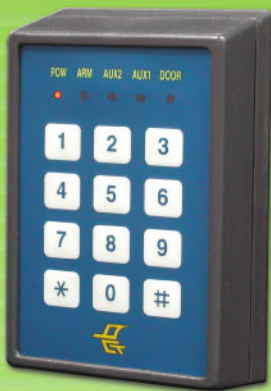
PP-5707 / PP-5878