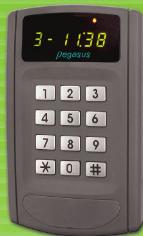
PP-6730 / PP-6830