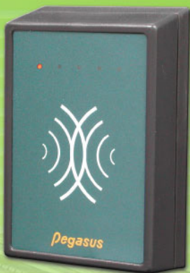
PP-5700 / PP-5800