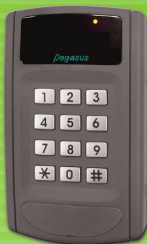
PP-6707 / PP-6878